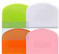
Example of a plastic scraper